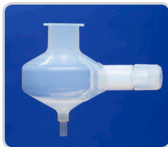
Side view of the PFA CSC (no exit port fitted) showing deep spoiler molded into sidewall

A partial listing of instrument compatibility is given in the ordering instructions. Part numbers 821-103 (with baffle) and 821-104 (without baffle) have a 12/5 socket connector which is commonly used in ICP-OES instruments. Typically, a baffle is used with ICP-MS but not with ICP-OES or MP-AES, since the baffle removes larger droplets which may overload the plasma in ICP-MS. The function of the baffle with the untreated PFA CSC is not as critical as with glass and quartz cyclonics, however, since the larger droplets tend to be removed through absorption by droplets on the side walls.