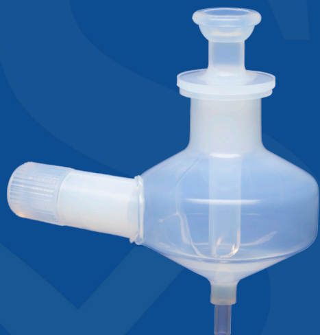
Savillex PFA Cyclonic Spray Chamber with Baffle